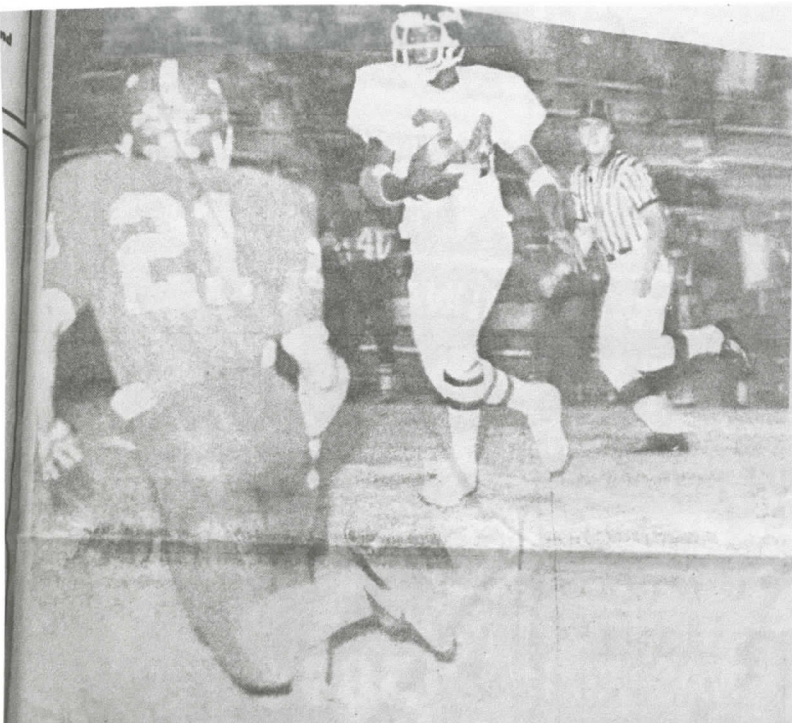
EARLY KM OFFENSE - The KM Mountaineers got the bulk of their 80 yards in offense on their first possession of the game when they drove 70 yards to set up their only score, a 21 yard field goal. Big play in the

Stowe had his best night of the season catching three passes, one for the final score of the game and another to set up a score.